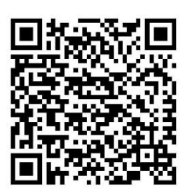
Figure 2. QR code, webpage of the book, http://www.ljevak.hr/knjige/knjiga-21996-kratka-povijest-knjiznica-i-nakladnika

The codes used in the book are supposed to be read by smartphones. The codes link the book to relevant content on the Internet. There are 139 QR codes printed in the book (95 printed in the text to illustrate it, and 44 printed at the end of the book, as additional codes).