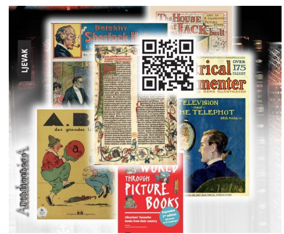
Figure 3. Part of the book cover, a QR code that links to the application is incorporated (www.povijestknjige.net), design by Luka Gusić

In order to ensure long-term availability of the sources behind the QR codes, publisher plans to maintain the list of URLs on the publisher's web site, i.e. on the webpage that is available in the book via QR code.