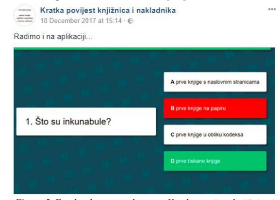
Figure 5. Facebook post on the page Kratka povijest knjižnica i nakladnika (Short History of Libraries and Publishers) – insight into a beta version of application, 18<sup>th</sup> December 2017

At the moment of publishing of the book (January 2018), the timeline of production was available on the social networking sites. Figure 5 shows a Facebook post, and Figure 6 shows a Tweet about some phases of the book production. It is planned to encourage interaction with the readers once the book is published, but everyone could interact on SNSs, even if they do not own, or have not read the book. New links and information that are connected to the content of the book will be published on SNSs. The content on SNSs will transform the printed book into an integrating resource — a resource that is changed by means of updates that do not remain discrete and are integrated into the whole [17].