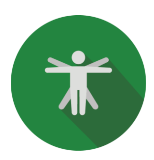
Figure 4. Icon from the application for the fifth chapter of the book, design by Fran Grgić

to contact the server. That kind of approach enables more fluid performance.