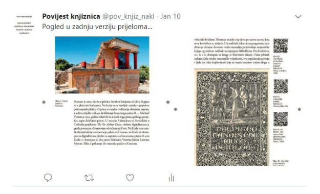
Figure 6. Tweet from 10<sup>th</sup> January 2018 – the insight into a final layout