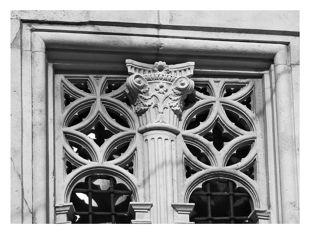
2. Šibenik, St James' Cathedral, main apse windows (1468–1473), detail.

softly modelled acanthus leaf with deep pipe-like dents and sharply serrated almond-shaped fringes, according to M. Gosebruch connected with Michelozzo's capitals,<sup>8</sup> and the palmette motif with bean-like sprouts (Gk. anthemion , It. lupiniere ), enabled the recognition of the second Renaissance layer of the chancel datable in the last years of Giorgio's supervision of the building. Apart from the pair of large capitals of the eastern pillars of the crossing and the corresponding decorative inserts on apse junctions, the stylistically purest Renaissance realization of the entire Giorgio's building phase was realized during this final period (1465–1473) – a series of five large rectangular paired windows forming a row on the main apse (figs. 1, 2). Structural maturity, good proportioning and consistent use of Early-Renaissance morphology pertinent to the capitals of slender fluted columns reveal not only the skilled application of the latest decorative repertoire, but also the knowledge of contemporary theoretical principles and corresponding aesthetic categories such as the diversity of new forms ( varietas ).<sup>9</sup> Combined with a certain dynamics and elasticity pertaining more to metal