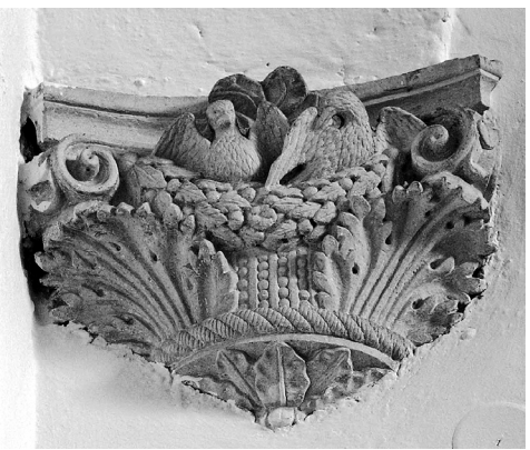
6. Dubrovnik, Church of St Dominic, sacristy, St Vincent's chapel (1470–1474).